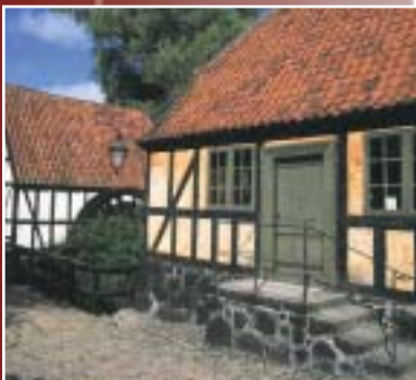
The Old Town