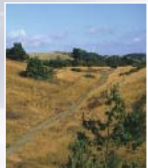
Hiking track at Mols