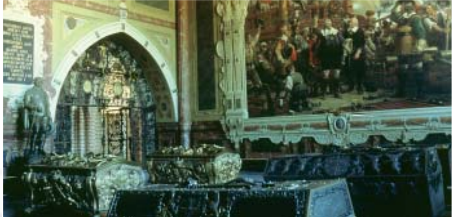
The chapel of Christian IV, in Roskilde Cathedral

The evening is at your own disposal, and Tivoli in Copenhagen will be a perfect place to visit.