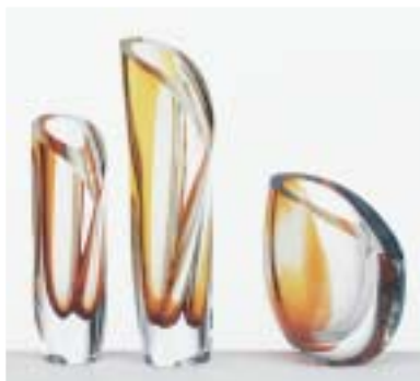
Amber by Göran Warff.

A well merited herd where many of the cow lines have their origins from Austria. Häggenäs was the first Simmental herd in Sweden to import polled simmental from Canada. One of those imports, the bull Ritzlund Pol Accel 32B, has made an great impact on the herd. Numerous male calves from Häggenäs have been sent to the Swedish bull testing station and many of them have been selected for the Swedish insemination programme. The most famous bull is