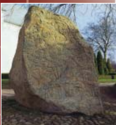
The Jelling Stone