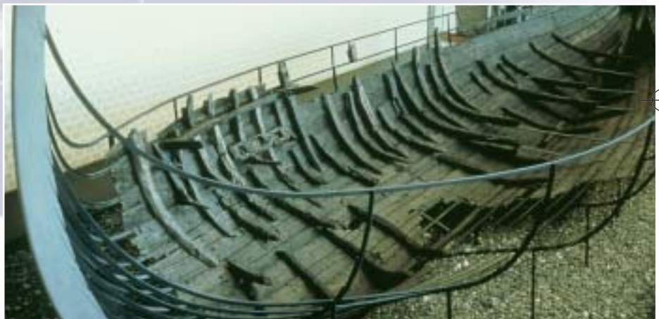
Wreck at the Viking ship museum

Join the 15th World Simmental Fleckvieh Congress in Denmark 2004 - an experience of "cows and culture"!