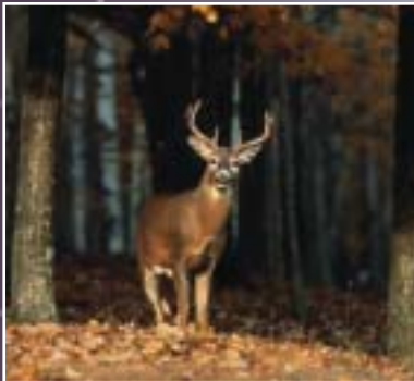
Eriksbergs game park

Transfer to airports - Copenhagen for further travel home, or Stockholm for those who wish to continue their journey in Scandinavia on their own.